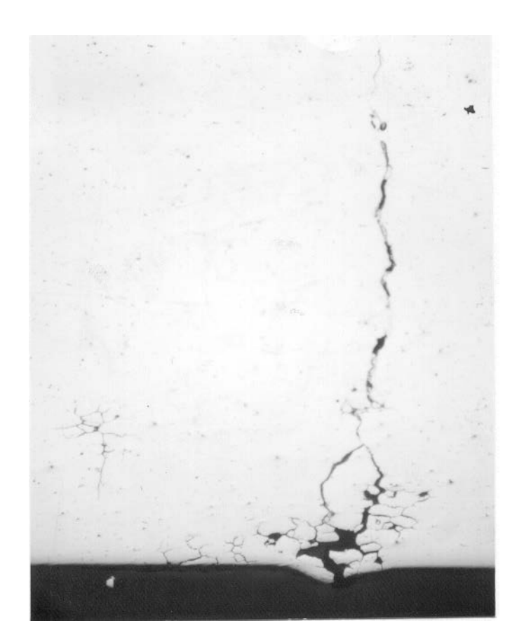
Figure 1 – HW Cylinders (AA 6061) Fatigue crack initiated from a corrosion pit. Magnification X 125

[6] ISO 11623 Transportable gas cylinders -- Periodic inspection and testing of composite gas cylinders